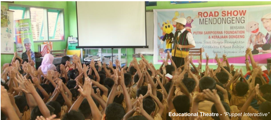
Educational Theatre - "Puppet Interactive"

DEALING WITH ROOT CAUSES OF CHILD LABOUR IN INDONESIA